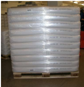
Figure 7: Optimal packing pattern of a bagged goods delivery

Optimum palletization requires a free pallet foot, no film residues, a flush packing pattern with no overhang and packaging that is safe for transport.