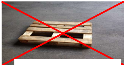
Figure 4: Missing board on the pallet