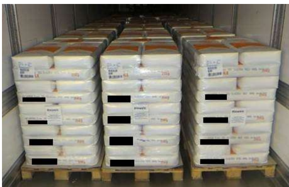
Figure 2: good example ✓