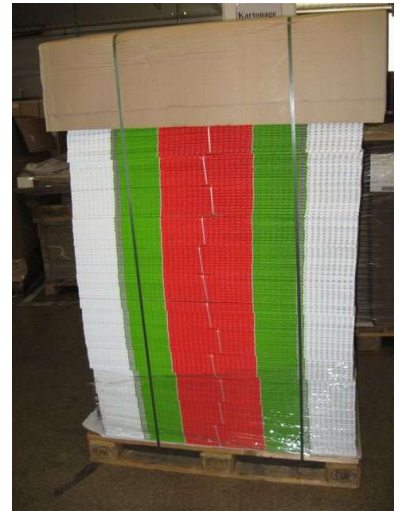
Figure 12: Exemplary securing of a cardboard box delivery

Pallet slips must not be inserted between the cartons that are stacked flat. However, they can be glued to the cover, for example. Fluttering labels / pallet slips are not permitted.