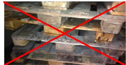
Figure 6: Condition not suitable for food