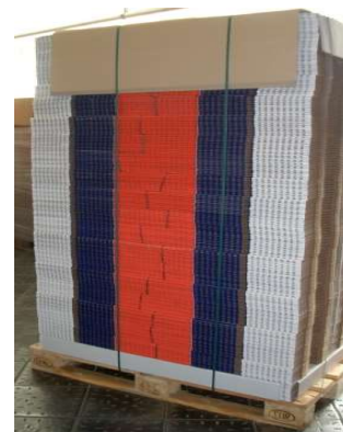
Figure 8: Optimal packing pattern of a carton delivery

Splinters and film tails on the pallet are not permissible, as these restrict the movements on the conveyor belt. The wrapping of the pallet ends just above the pallet foot so that the wrapping only covers the area of the deck board. Under no circumstances may the fork clearance be covered by the wrapping.