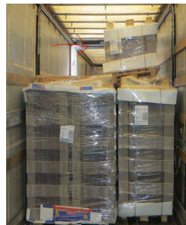
Figure 3: bad example ✗