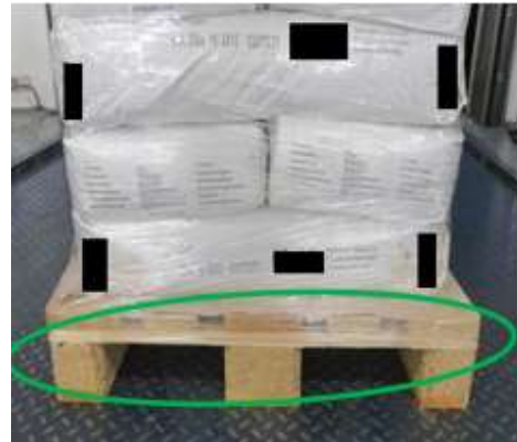
Figure 10: Exemplary wrapped pallet

Under no circumstances may flying / fluttering parts (e.g. customer or pallet slips) hang on the pallet. These can cause malfunctions in the light barriers of the conveyor system and the goods receiving area and make it more difficult or even falsify the measurement of the pallets.