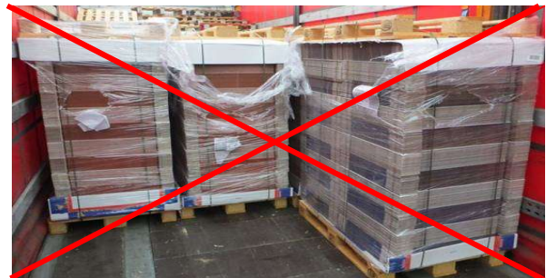
Figure 11: Loose or fluttering parts on the pallet

Under no circumstances may flying / fluttering parts (e.g. customer or pallet slips) hang on the pallet. These can cause malfunctions in the light barriers of the conveyor system and the goods receiving area and make it more difficult or even falsify the measurement of the pallets.