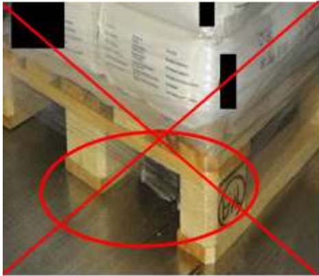
Figure 9: too deep wrapped pallet