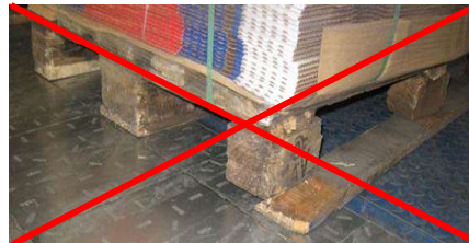
Figure 5: Loose board on the palett