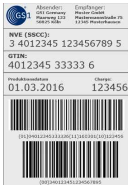
Figure 1: Example of a GS1-compliant pallet label

For this purpose, pallet labels or GS1-compliant pallet labels must be attached to the loading units in such a way that they are clearly visible during unloading.